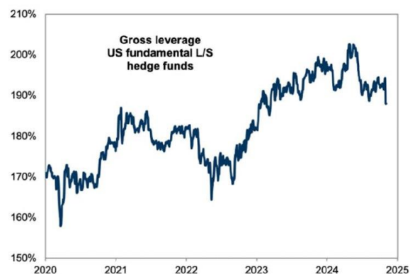
Exhibit 5: HF gross leverage declined ahead of the election